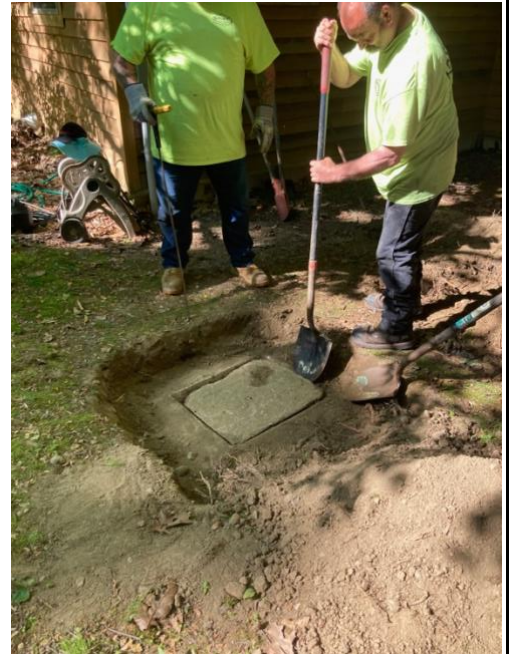
June septic inspection Assembly Point

The LGPC has prepared an excellent FAQ on their Septic Inspection Program. You can find the link here ( Septic Inspection Program FAQs LGPC ) or on the Lake George Park Commission website.